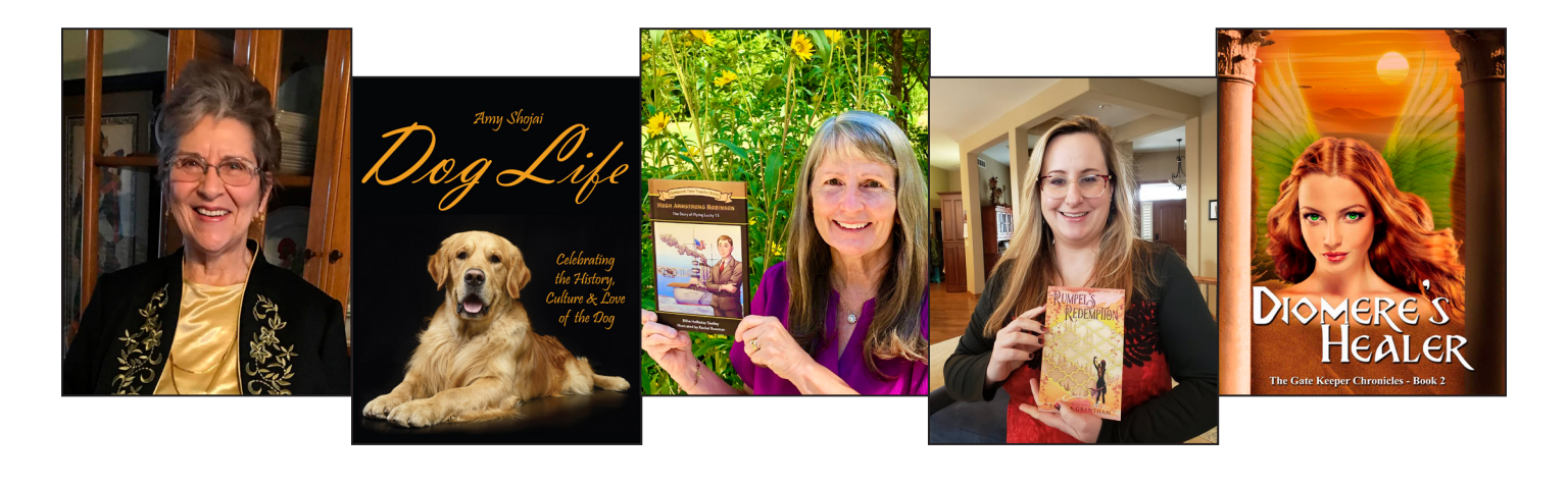
Thank you to the published book category winners for the use of their photos.